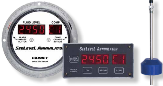
Outside Display Model 806-B