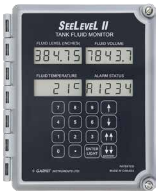
Multiple Configuration Options