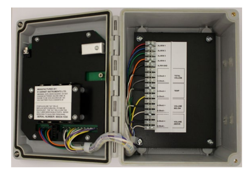
Interior of the 900-D4I

Display Enclosure: The entire display is enclosed in a weatherproof fiberglass enclosure with a hinged cover. This provides all weather operation and easy access to the internal batteries. The enclosure must always be kept tightly closed when not changing batteries to prevent water damage to the electronics. Never open the display enclosure when rain or water could enter the box.