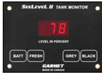
Model 709-RVC NLP