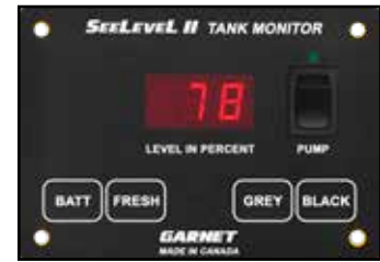
Model 709-RVC PM