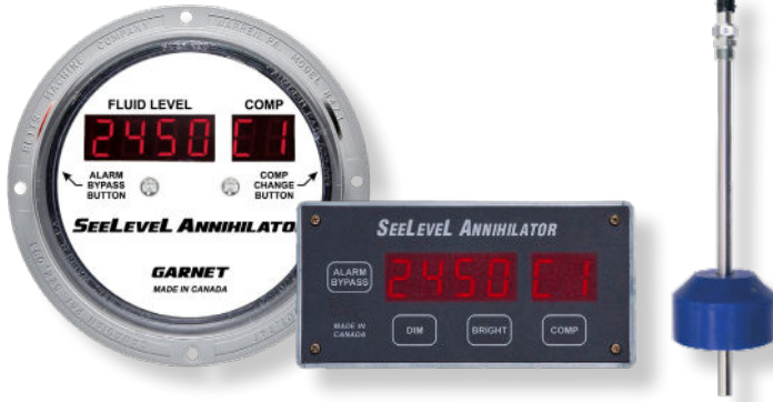
Outside Display Model 806-B