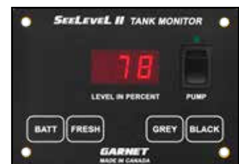
Model 709-RVC PM