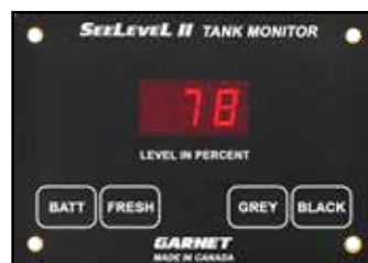
Model 709-RVC NLP