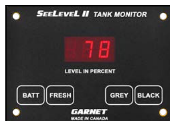
Model 709-RVC NLP